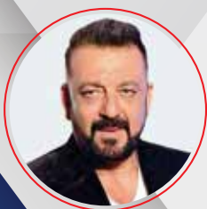
Mr. Sanjay Dutt Award Winning Actor & Cancer Survivor, Global Champion for Cancer Care The Defeat - NCD Partnership at United Nations Institute for Training and Research